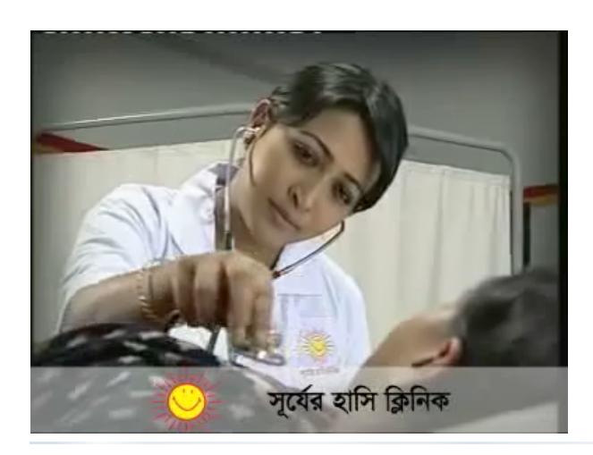
Figure 1. Screenshots from control and treatment videos